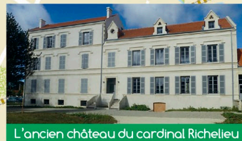
L'ancien château du cardinal Richelieu

* Les temps d'arrêt ne sont pas inclus dans l'estimation du temps de trajet